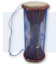
Mossi talking drum (2000.137.3.1)