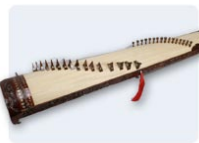
Vietnamese long zither (2000.136.4.1)