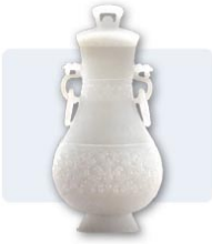
Chinese vase (80-441.1-3)