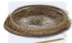
German fish trap (84-155.1)

Optional: Consult the artifact database and select artifacts related to a subject you are exploring; print out one record per student, or save the records so that you can project them.