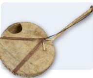
Touareg one string fiddle (2000.135.1.1)